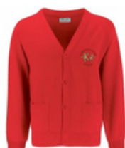
ALDERMAN JACOBS CARDIGAN From £15.25