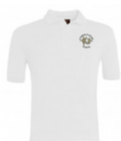
ALDERMAN JACOBS POLO SHIRT From £8.75