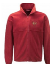
ALDERMAN JACOBS POLAR FLEECE £18.75