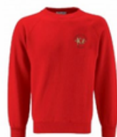
ALDERMAN JACOBS RAGLAN SWEATSHIRT From £13.75