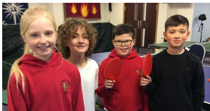
Year 6 Team